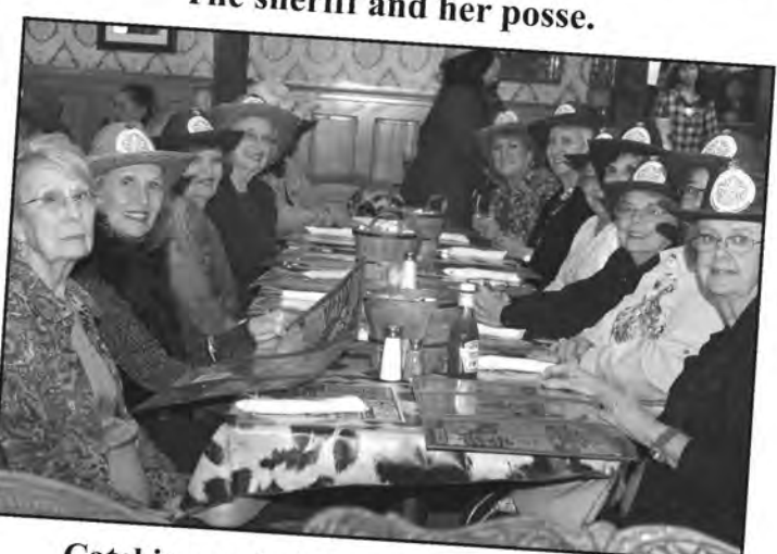
Catching up before being served dinner. The cowboy hats were not optional.