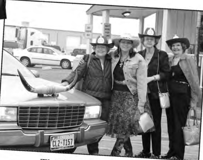
The sheriff and her posse.

Wednesday evening spent dining at The Big Texan. Three limos arrive at the hotel to transport TFWC board members in true "TEXAS style."