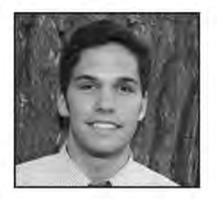
TFWC State Scholarships in the amount of $1,000 each