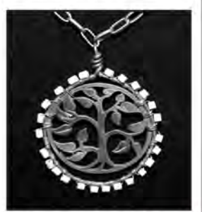
She crafted this!