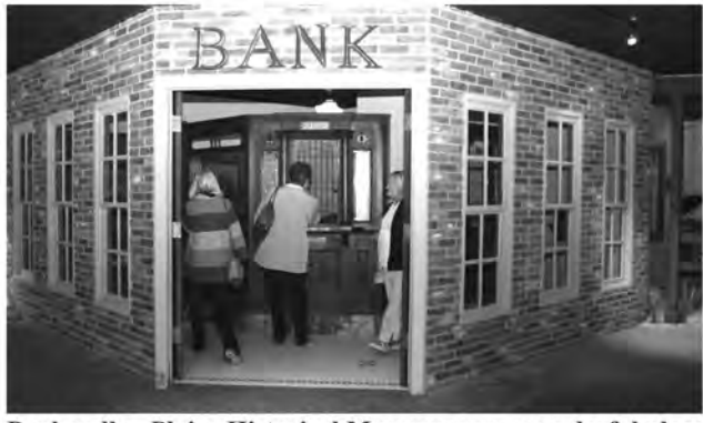
Panhandle - Plains Historical Museum was a wonderful place to learn about our heritage.