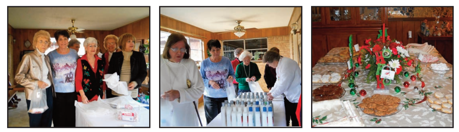
The Coterie Club got busy and filled 80 bags for a nursing care facility and then enjoyed this beaurtiful table of Christmas Season goodies.

LIBERTY -- During the December meeting of the Liberty Coterie Club 80 bags were filled with items for residents of the Magnolia Place Health Care Facility. Items included: body powder, lotion, white socks and peppermint candies. Enough bags were filled so that each resident would receive a gift Christmas Morning. Liberty Coterie is a Cat. I club in Magnolia District and this is a recurring project. Afterward the members enjoyed a delightful and tasty Christmas Tea. Congratulations on a job well done ladies! See pictures below.