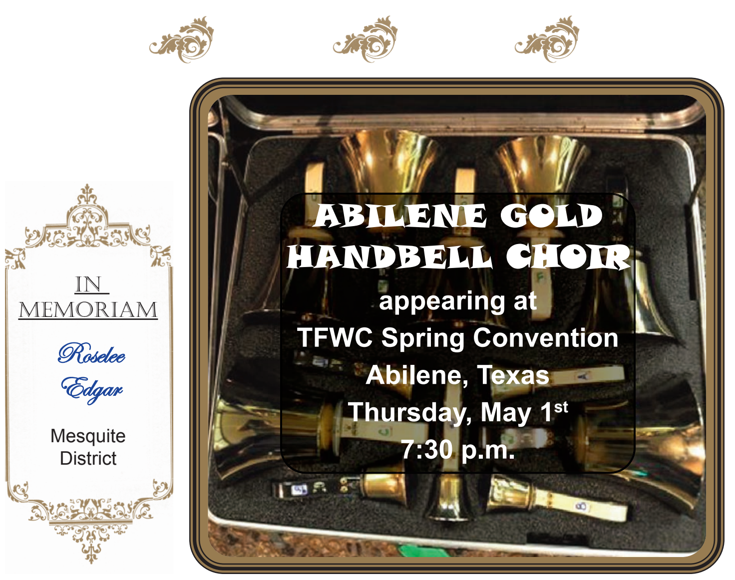
The Texas Clubwoman, Page 19_