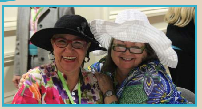
_The Texas Clubwoman, Page 5 ___