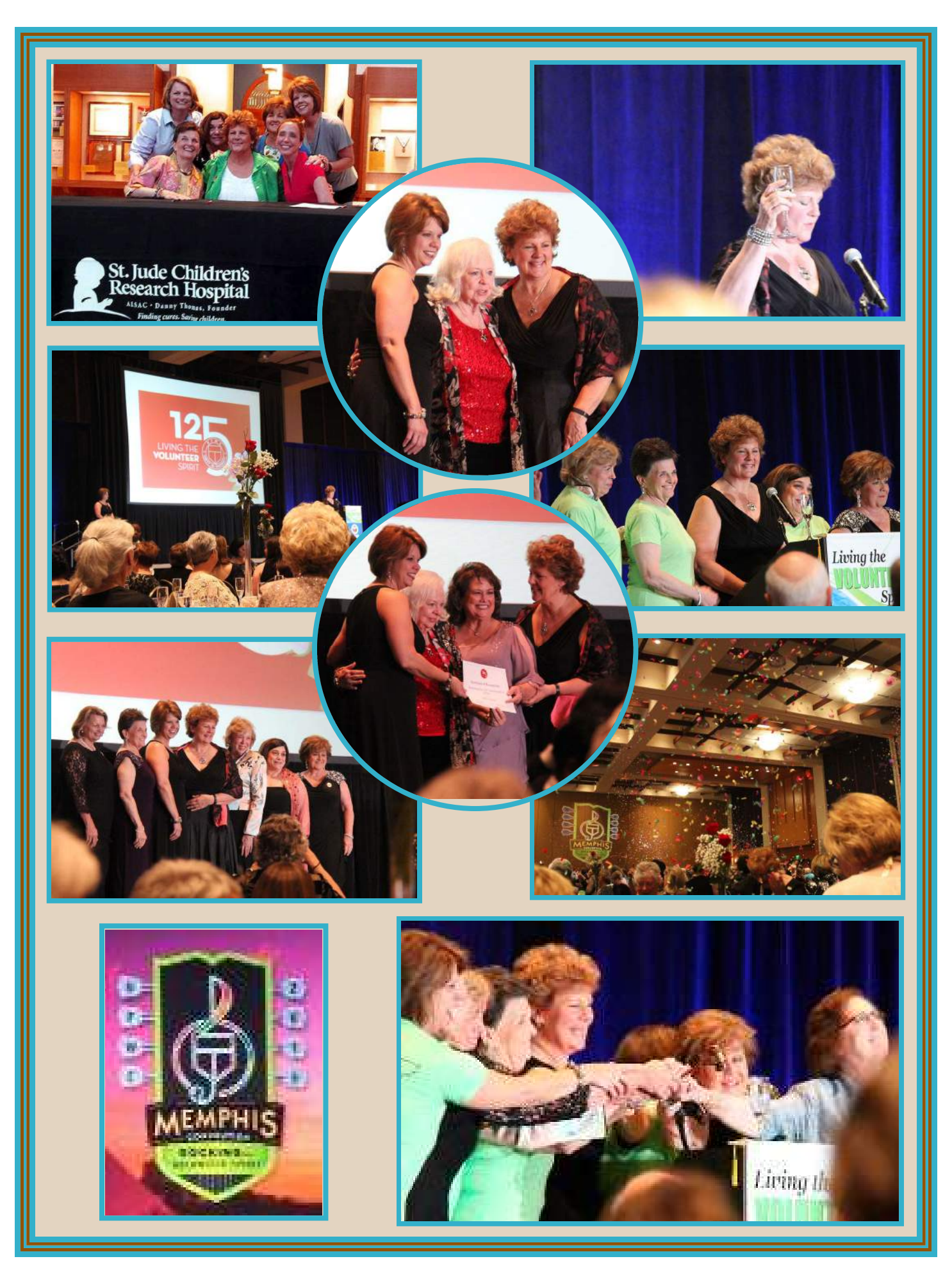
_The Texas Clubwoman, Page 7 _____