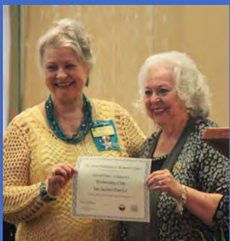
San Jacinto District