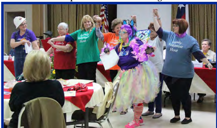
The Reporting Fairy and the lonely Volunteers get together and see progress with the wave of a wand. Magic!