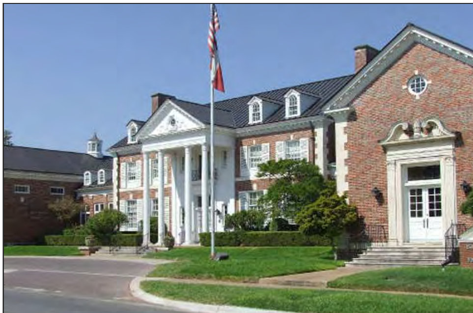
TFWC Headquarters 2312 San Gabriel; Austin, Texas 78705-5014.