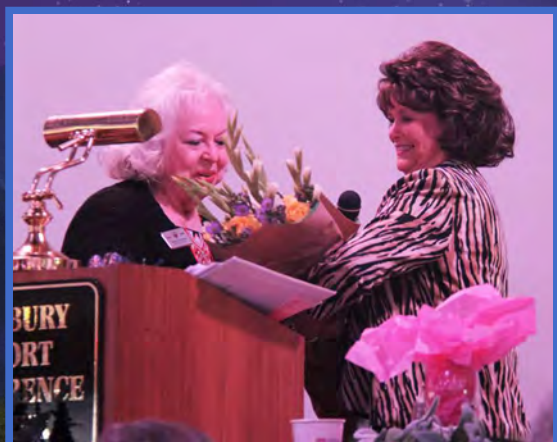
Yes, there were yellow roses.