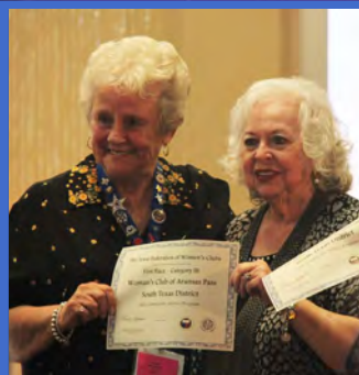
South Texas District