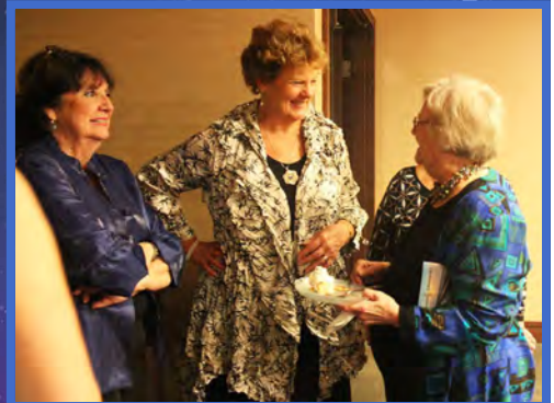
Fun and Fellowship