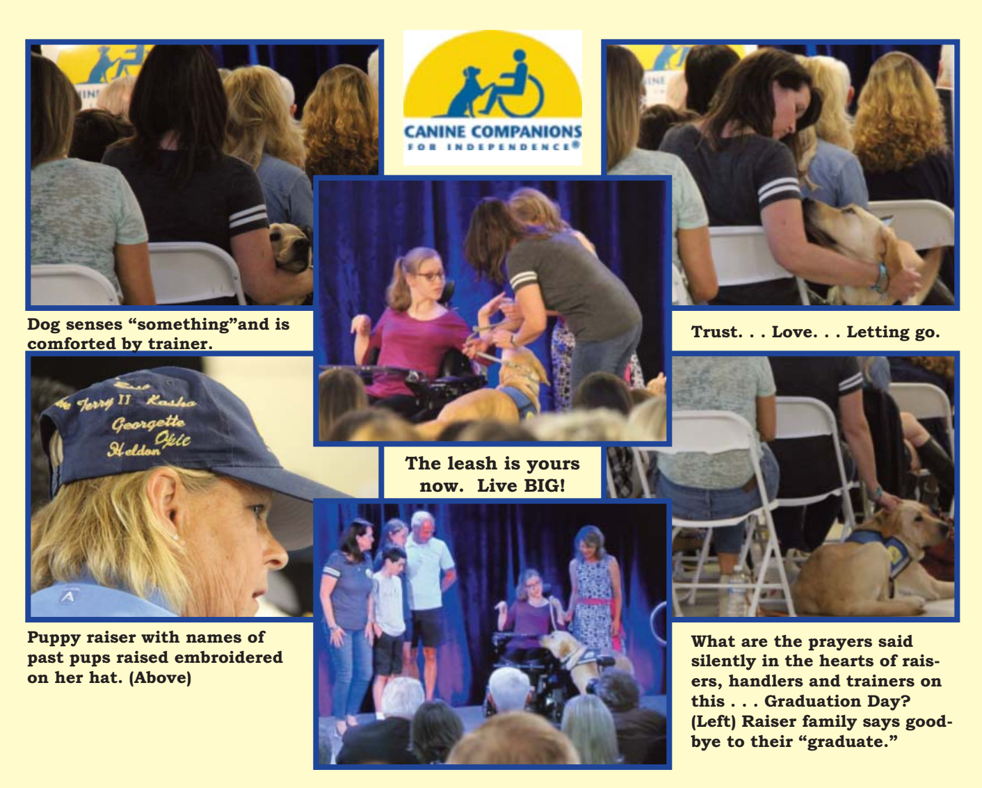
The Texas Clubwoman, Page 7