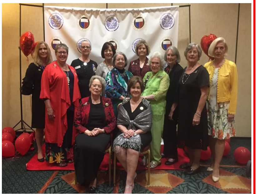
Texas Members of the GFWC Million Dollar Club