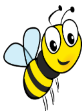
GFWC Gunter Ladies for Tomorrow Club presented "Protect the Pollinators" to Gunter Elementary School. The club donated crayons and a "bee" color sheet to 415 students. How cool is that?!!!