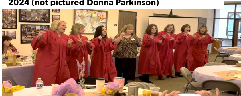
Left: GFWC Sisters entertaining and singing a rendition of the song "We are Family."