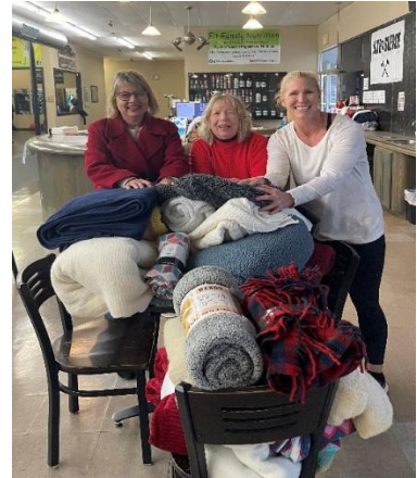
Above left: Amity Study Club takes a group photo after playing a game of "Bunco" to raise money for the local Library. Middle: Club members delivering essential items to the local women's shelter. Right: Club members collected blankets for the homeless shelter.