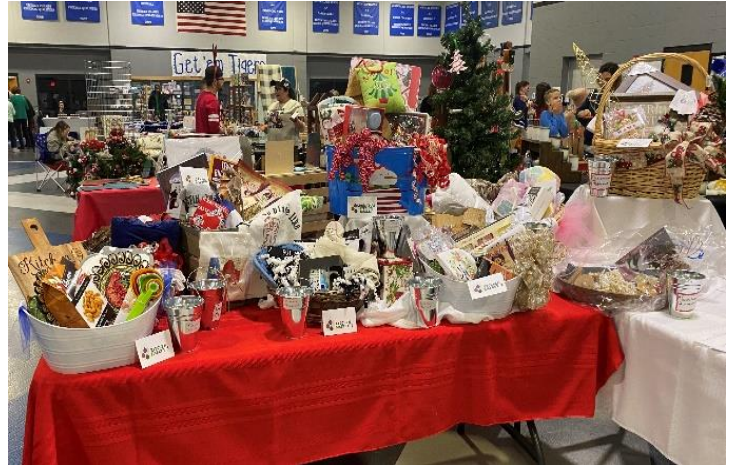
Members of GFWC Gunter Ladies for Tomorrow club assembled 22 baskets for a raffle and silent auction. The club will use the funds for scholarships, the local library, and club projects.