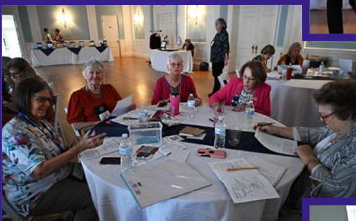
Writing "Thank You" notes to food banks across Texas.