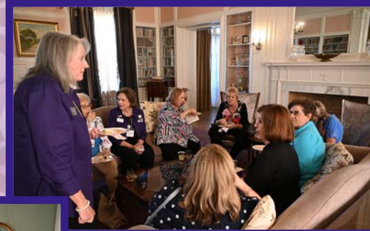
Visiting during break.