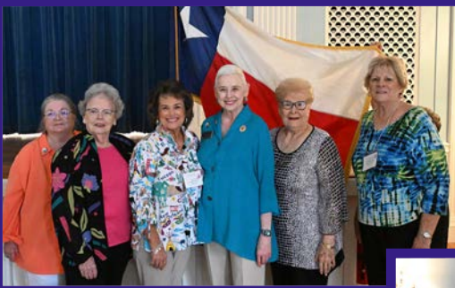
Can you find the current president of GFWC Texas?