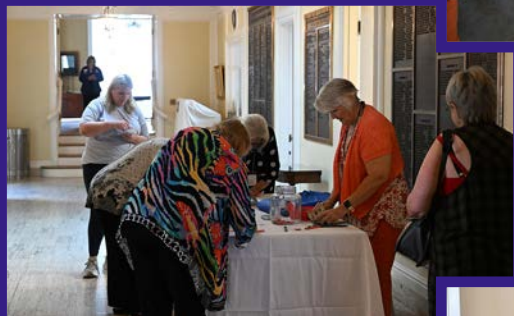
Chances being purchased for a $500 HEB card.