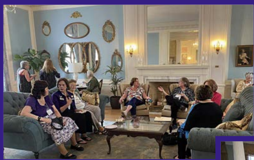
It was a treat to get to visit and enjoy "our house."