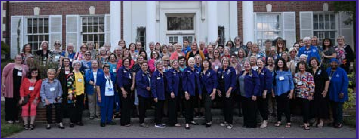
Most of the 79 attendees of the Fall Board Meeting in front of GFWC Texas Headquarters.