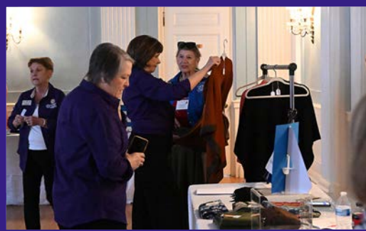
Shopping those fundraising tables is our thing!