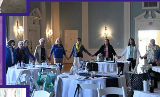
The sweetest part of our meetings. Clapping hands and singing before the session is closed.