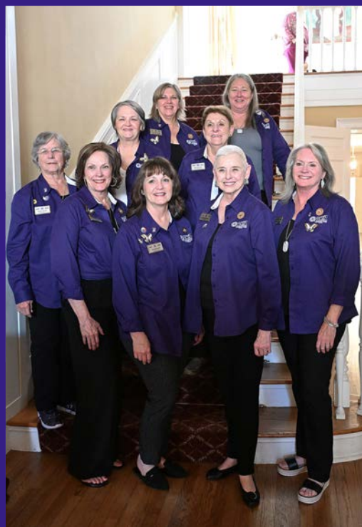
GFWC Texas Executive Board.