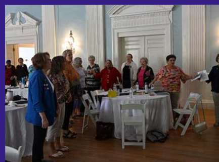
"The Collect" in unison.